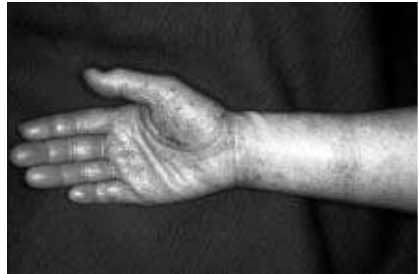
Fig. 4 Moist-form housewives' eczema The eczema occurs acutely and is associated with severe itching and inflammation. The forearms and dorsal hands are also affected. In many cases, an allergic mechanism is suggested (43-year-old patient exacerbated by rubber gloves).

Itching is mild and rarely involves the back of the finger other than the end phalanx. Once