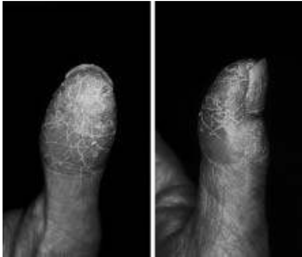
Fig. 3 Dry-form (KTPP) housewives' eczema Keratotic inflammation presents as disappearance of fingerprints and gloss. Such inflammation frequently involves the entire area around the distal phalanx, often associated with abnormal nail growth (79-year-old patient).